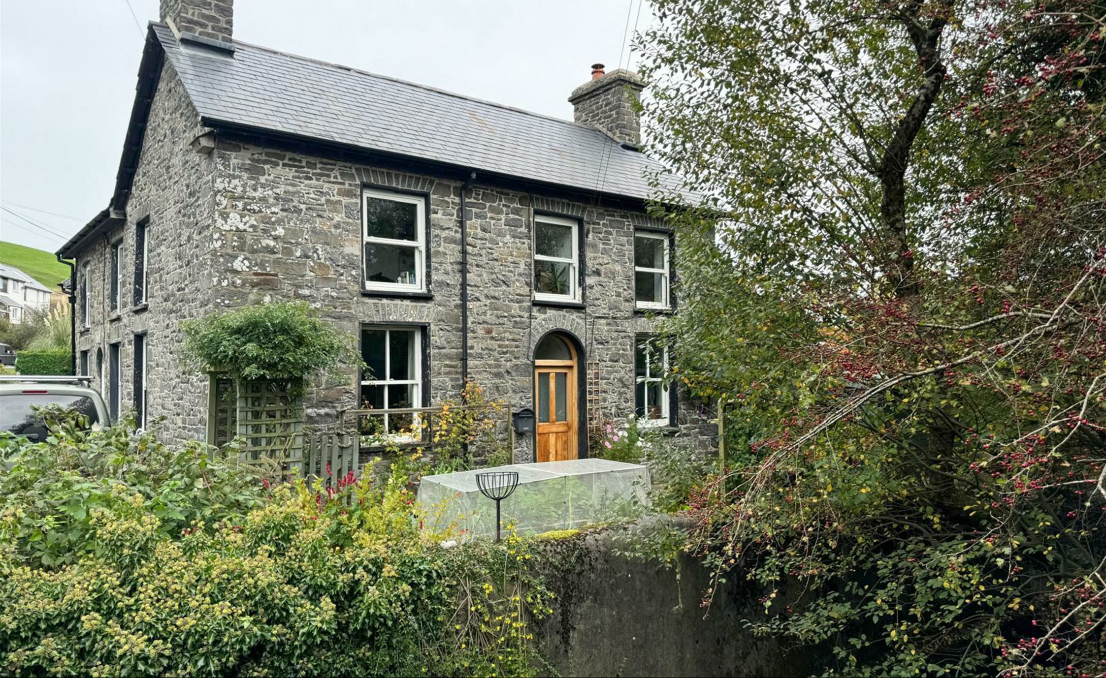
Penybont , Llangwryfon Aberystwyth Ceredigion SY23 4EZ Guide price £245,000